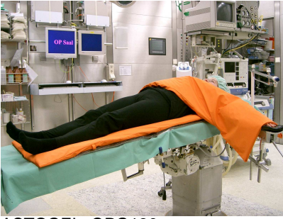
ASTOGEL OPG130 Gel pad for prophylaxis of pressure sores ASTOPAD COV150 Heated blanket as under blanket ASTOPAD COV150 Heated blanket as arm-chest cover