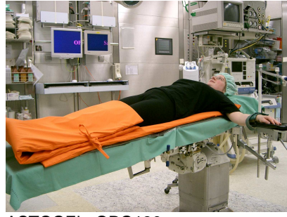
ASTOGEL OPG130 Gel pad for prophylaxis of pressure sores ASTOPAD COV150 Heated blanket as under blanket ASTOPAD COV150 Heated blanket as leg bag