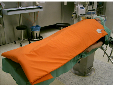
ASTOGEL OPG130 Gel pad for prophylaxis of pressure sores ASTOPAD COV150 Heated blanket as under blanket ASTOPAD COV180 Heated blanket as full body cover