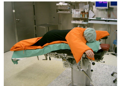
ASTOGEL OPG130 Gel pad for prophylaxis of pressure sores ASTOPAD COV150 Heated blanket as under blanket ASTOPAD COV150 Heated blanket as leg bag ASTOCOVER PAS155 Passive warming insulation as arm-chest cover