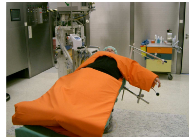
ASTOGEL OPG130 Gel pad for prophylaxis of pressure sores ASTOPAD COV150 Heated blanket as under blanket ASTOPAD COV150 Heated blanket as leg bag ASTOCOVER PAS155 Passive warming insulation as arm-chest cover