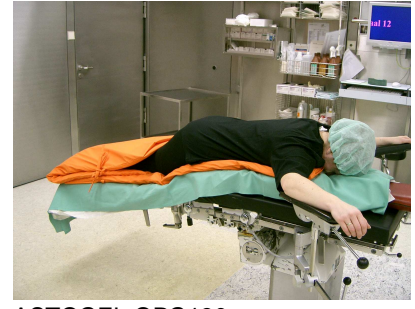
ASTOGEL OPG130 Gel pad for prophylaxis of pressure sores ASTOPAD COV150 Heated blanket as under blanket ASTOPAD COV150 Heated blanket as leg bag