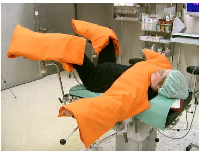
ASTOPAD COV150 Heated blanket as leg bag ASTOCOVER PAS155 Passive warming insulation as arm-chest cover